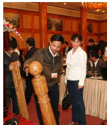
For more information on strand woven bamboo technology, please visit the Mekong Bamboo website at http://mekongbamboo.org/

The physical properties of the product have been tested, which showed the potential to replace wood-based material. This means it could be used for bamboo flooring, door frames, stair poles and various furniture items.